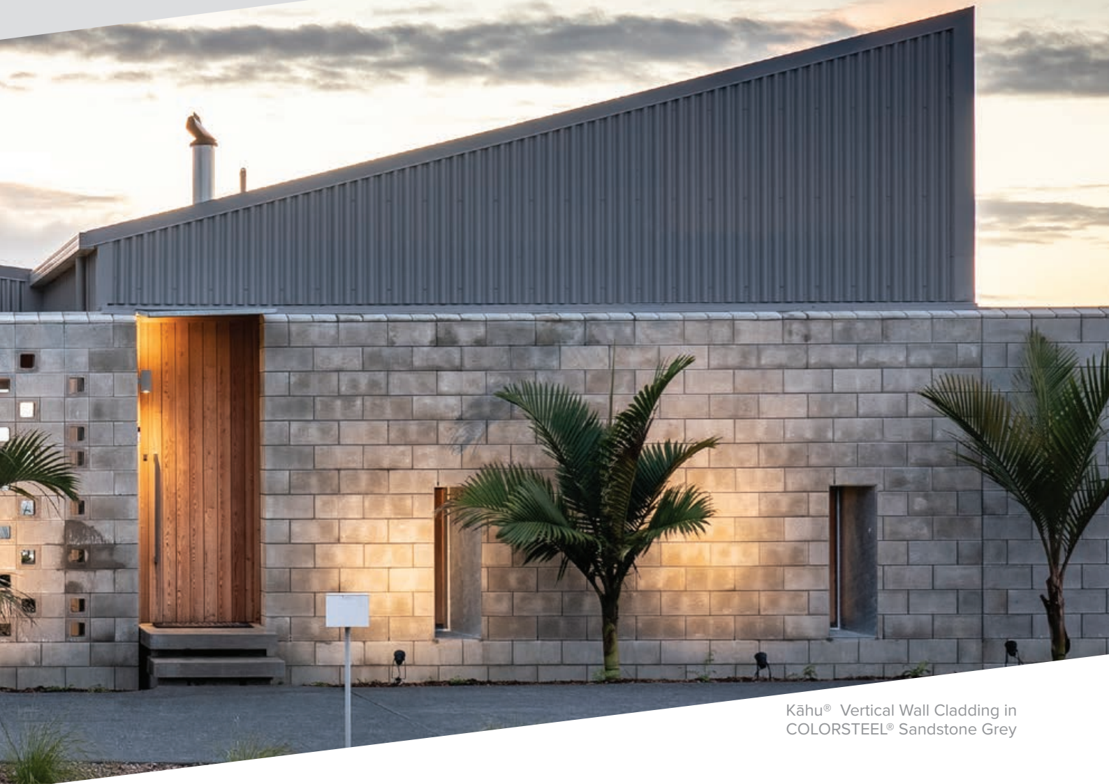
Kāhu® Vertical Wall Cladding in COLORSTEEL® Sandstone Grey