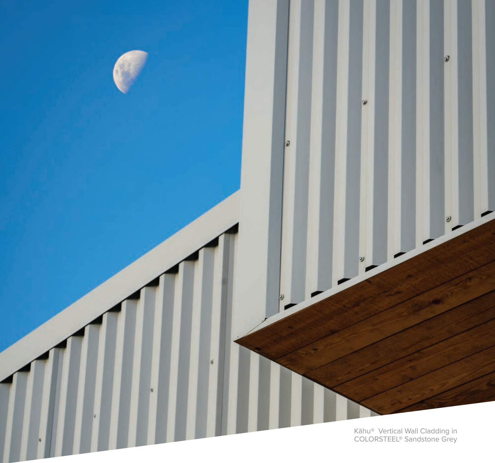
Kāhu® Vertical Wall Cladding in COLORSTEEL® Sandstone Grey